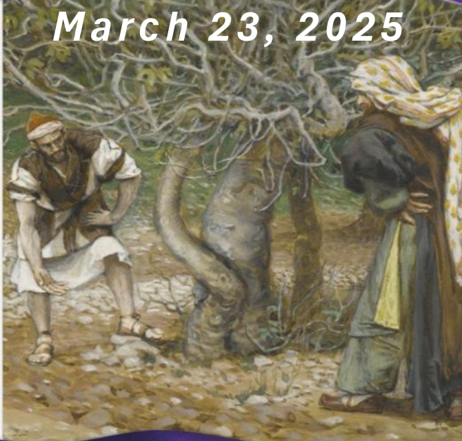
The Vine Desser and the Fig Tree by James Tissot, circa 1890s

3 RD SUNDAY OF LENT 3 º DOMINGO DE CUARESMA